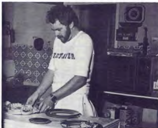
The chef carefully prepares a dish in The Beefeater kitchen.