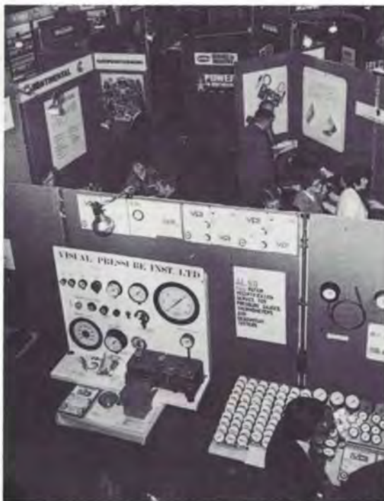
A bird's eye view of the well-planned layout in the Memorial Hall, Wrexham, which housed 25 exhibitors.

"In meeting so many people in local government, industry, commerce—and even some of our domestic customers—I have the feeling that MANWEB's image in the District is riding high—higher than I have ever experienced before. I can only put it down to the success of our exhibition. All MANWEB staff were on top form throughout the three-day show. So much so that we must have made many new friends