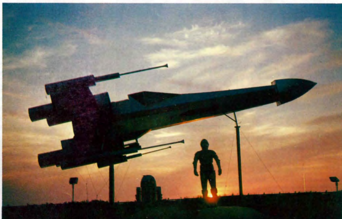
The Winner (see centre pages)