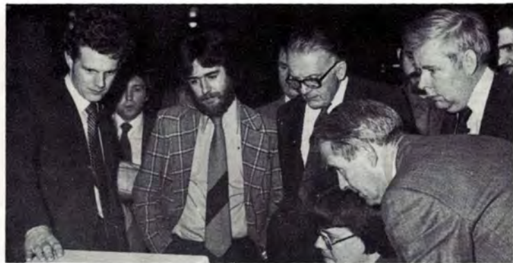
Three pictures of delegates showing keen interest in the computer terminal equipment which was demonstrated at the meeting.

Concluding, Dr. Smitton said that energy must be used wisely and efficiently, and that nuclear power was the safest, cheapest and the cleanest source for the nation's energy needs in the future.